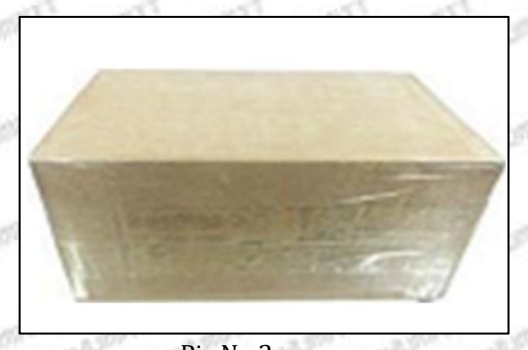
Pic No.2 Domestic express packaging: Wrapped by Transparent tape

A Minors are prohibited from using transparent tape, yellow tape, black wrapping protective film, and white wrapping protective film to avoid personal injury.